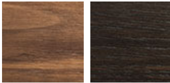
NC nussbaum canaletto